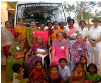
PINCC India's first campaign

Following the August 2009 visit, several of the doctors were comfortable enough, after only one cycle of training, to begin VIA screenings and to carry out Cryo procedures.