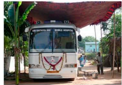
The Mobile Hospital bus, containing a lab, x-ray machine, and ultrasound.