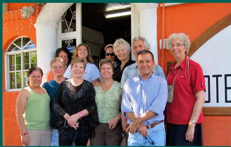
Our team in San Salvador, Nov. 2010

Africa: After 3 campaigns, the Kitale hospital in Kenya is now self-sufficient, with a staff of 3 doctors and 12 nurse-midwives trained, and all the equipment needed for screen-and-treatment. Two new sites, Kisii and Kapenguria hospitals, are training 6 doctors and 30 nurses, which will cover an area from the Tanzania border to the Pokot region of the Rift Valley. We completed training at